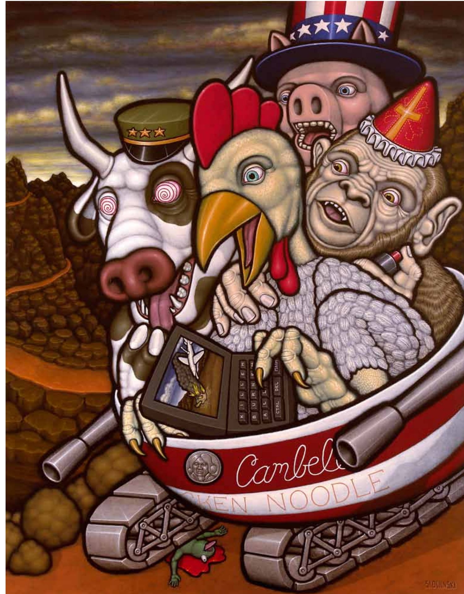
Right: Chicken Soup Acrylic on canvas 56" x 42"