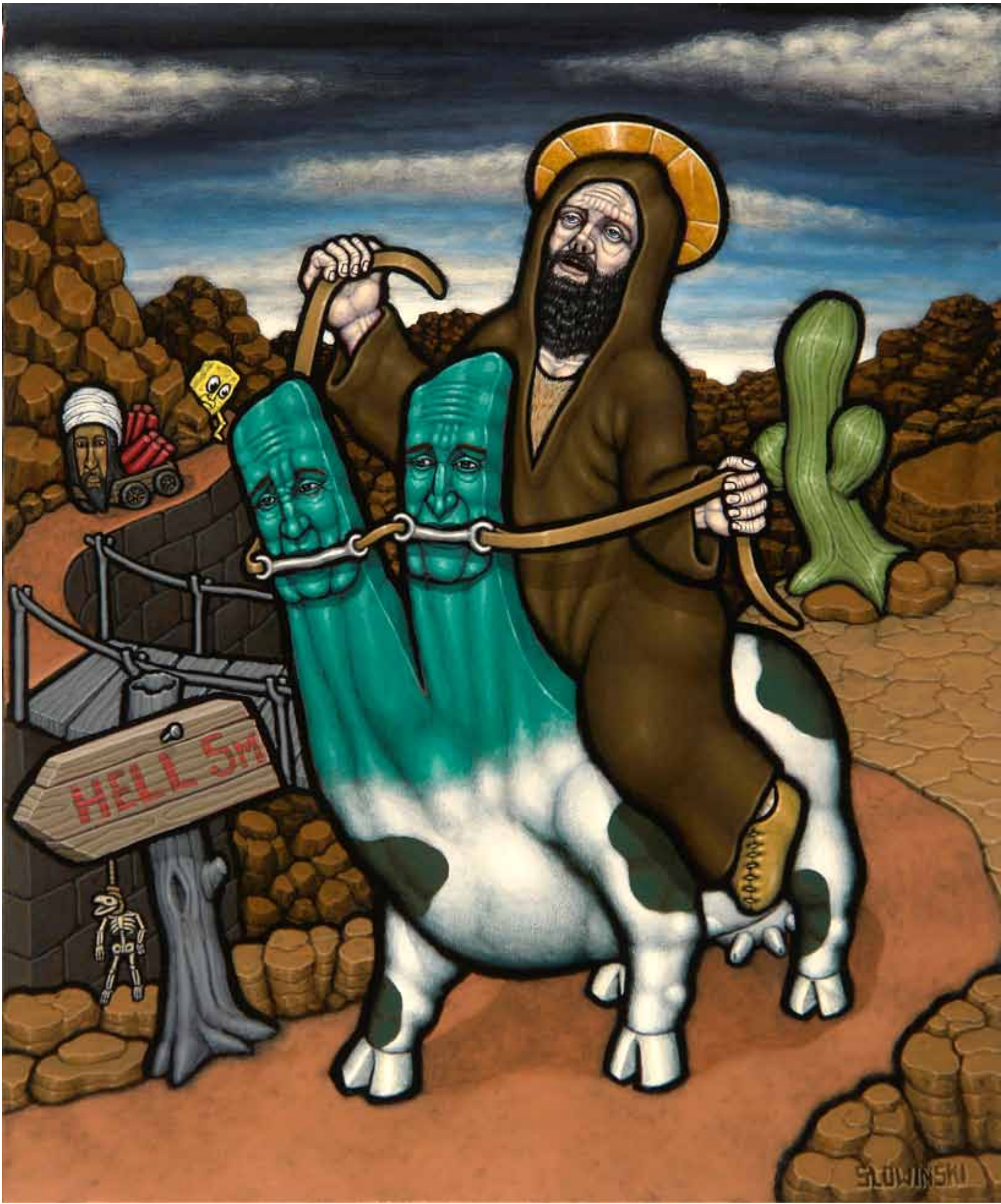
The Road to Hell Acrylic on canvas 24" x 20"