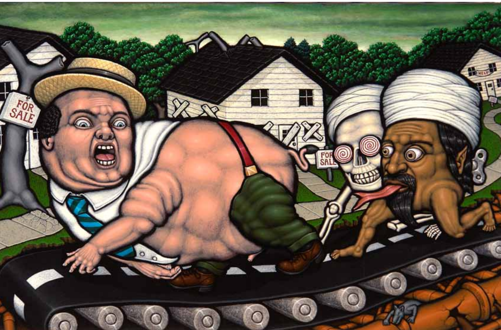
The Road to Ruin (A Race to Nowhere) Acrylic on canvas 24" x 38"