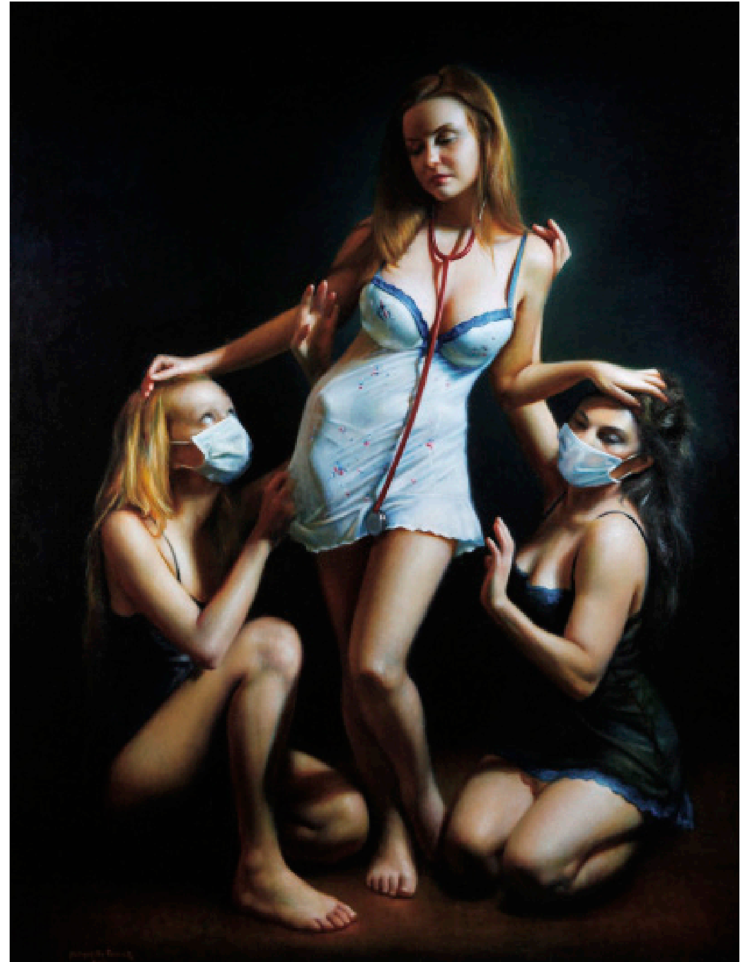
At right: Three Nurses Oil on linen 54" x 70"

Each piece comes from my desire to address archetypal, stylized, or cliched feminine experiences. I confine the subjects in a refined veneer, and detail these experiences within the female figure--in all of its beauty, absurdity and perversity.