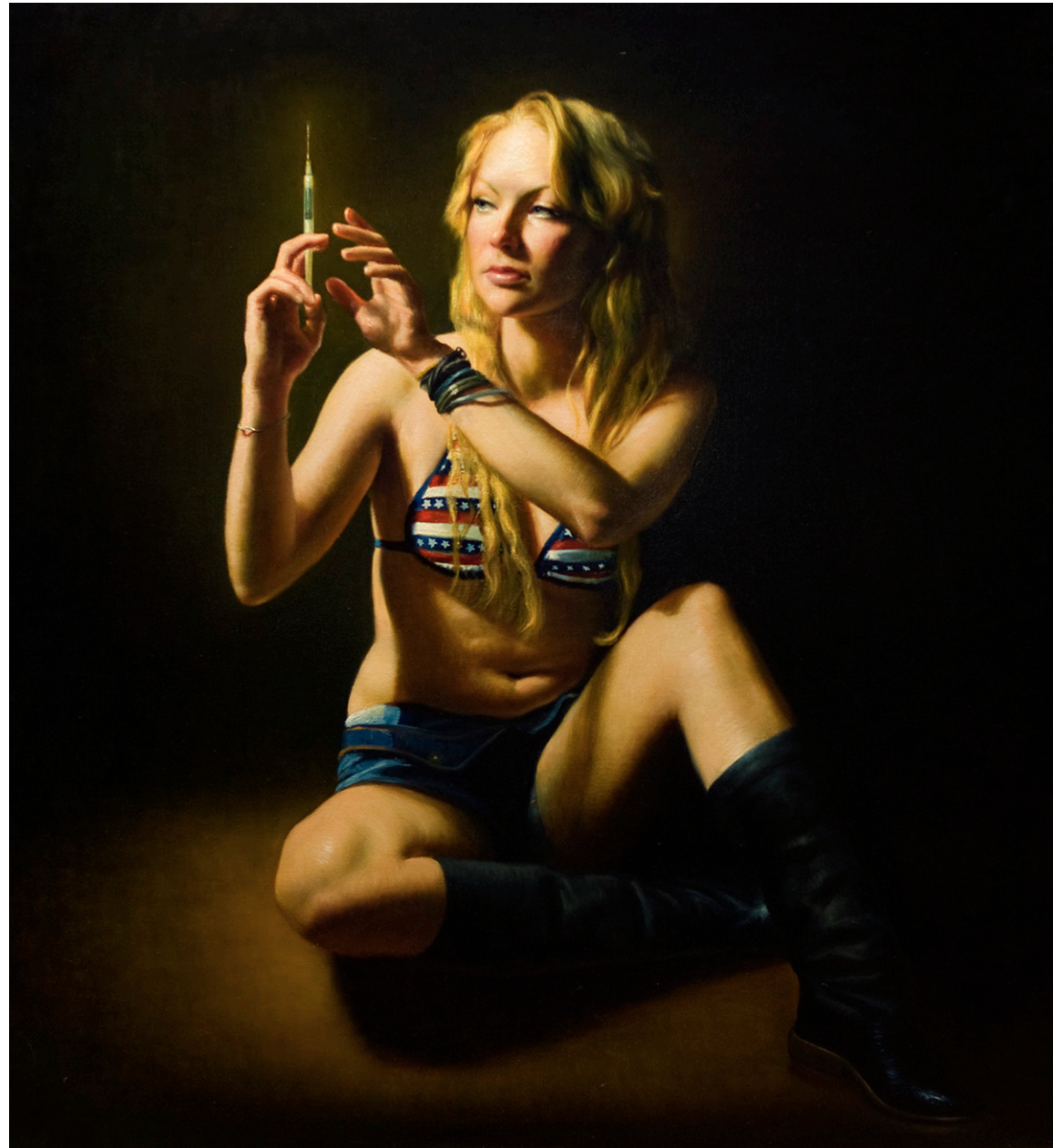
Stimulus Oil on linen 53" x 50"