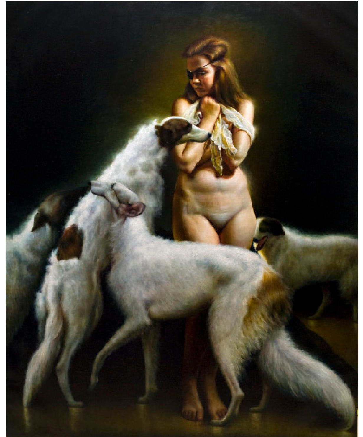
Hounded Oil on linen 58" x 72"