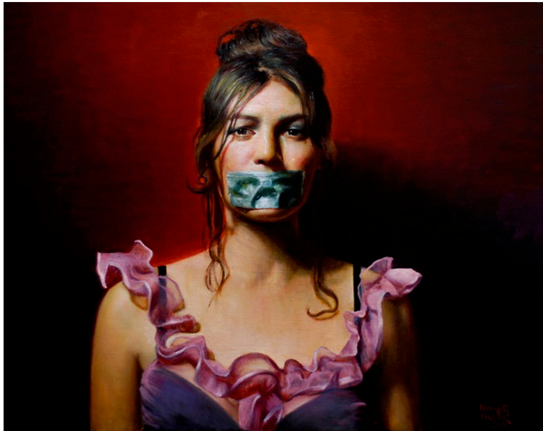
Hostage Oil on linen 28" x 36"