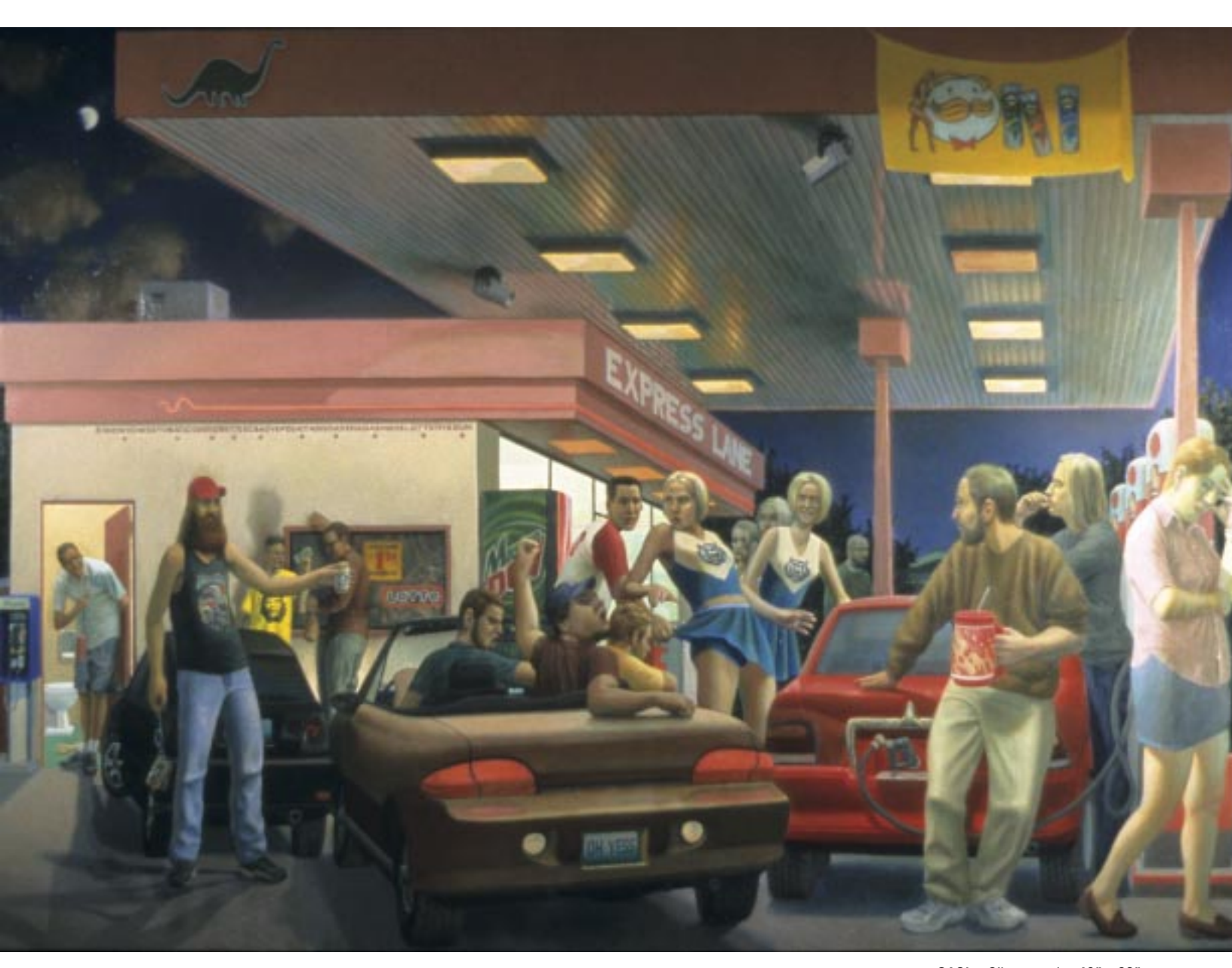
GAS! Oil on panel 48" x 60"

In "Ghosts and Zombies" I began with the idea of an analogy between Republicans and Democrats, or between their cliched portravals-mindless gut reactors and inactive contemplators. It ended up more generally about id versus ego or extroverts and introverts. Mount Rushmore is left over from that initial plan that didn't add up, but it reinforces these two directions of frivolous fun and memory. Narrative is always out at the edge of what functions as a visual idea, so much of the event gets buried in the form. I think people have the false impression that art works are about one thing, so clarity of image or inventiveness in design starts to negate other content. Creative processes are more open-ended than that. I was thinking of glow-in-the-dark Halloween decorations when I decided the ghost should be bright green, but I also just wanted an excuse for that color situation.