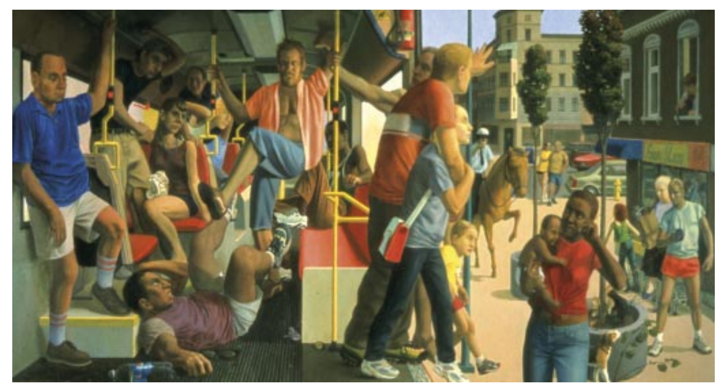
Inventing the Wheel Oil on panel 44" x 78"