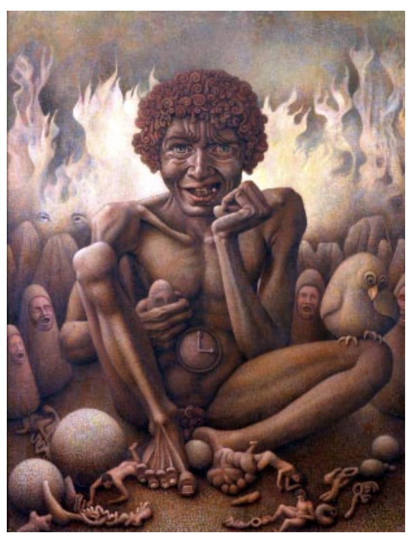
The Stone Eater, 24 X 36 inches, oil on linen, 1968

As part of Apocalypse, in October we held the very serious WILLIAMSBURG SYMPOSIUM ON THE FUTURE OF MAN, which brought