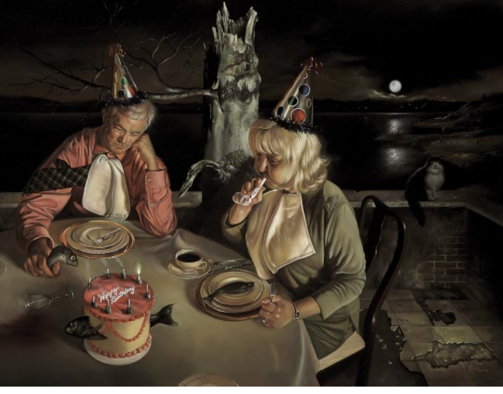
Happy Day's Are Here Again Oil on wood 14" x 18" What are their options? The old saying, "Misery loves company," must be true.