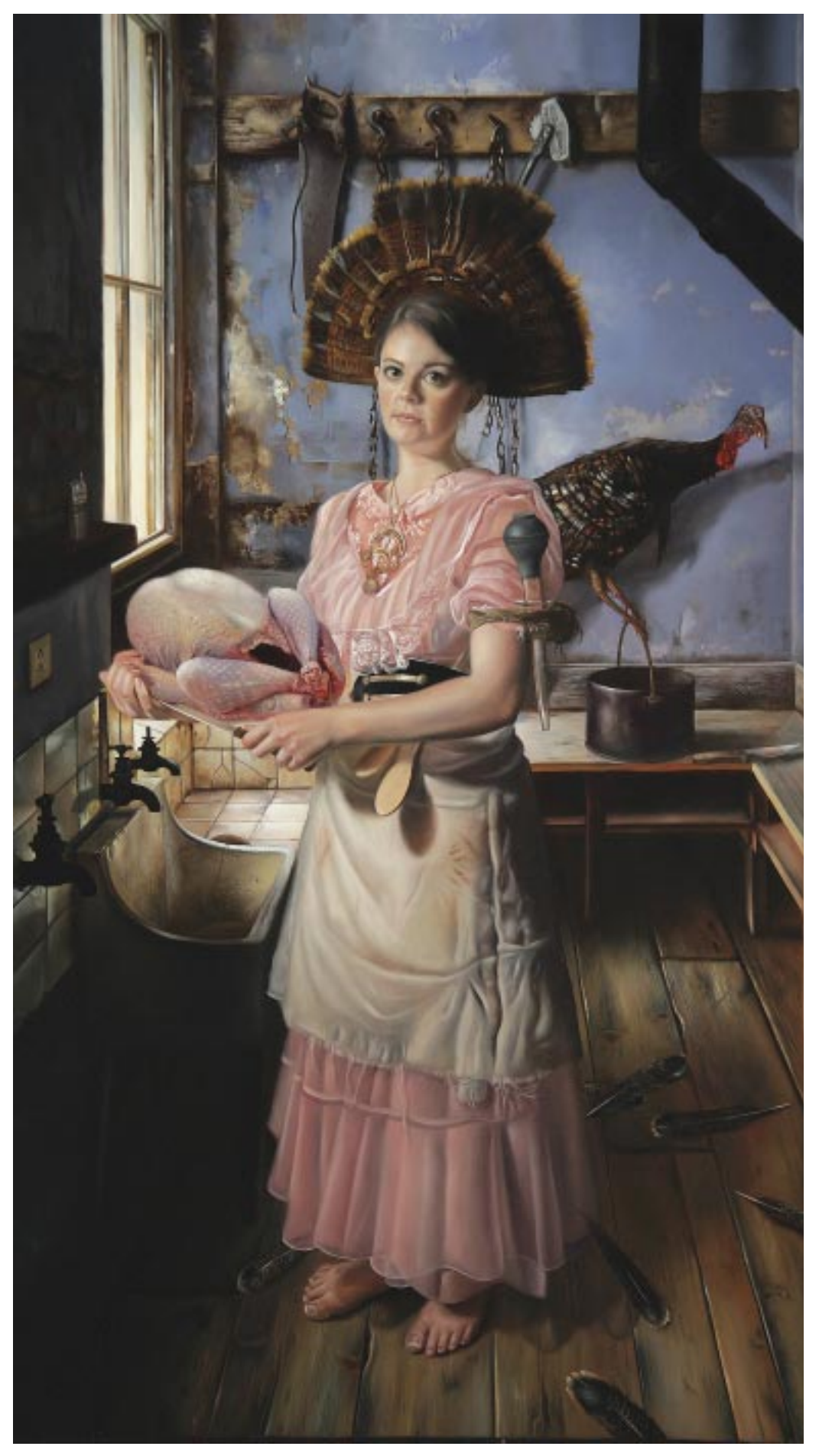
The Sacrifice Oil on linen over wood 19.25" x 11"